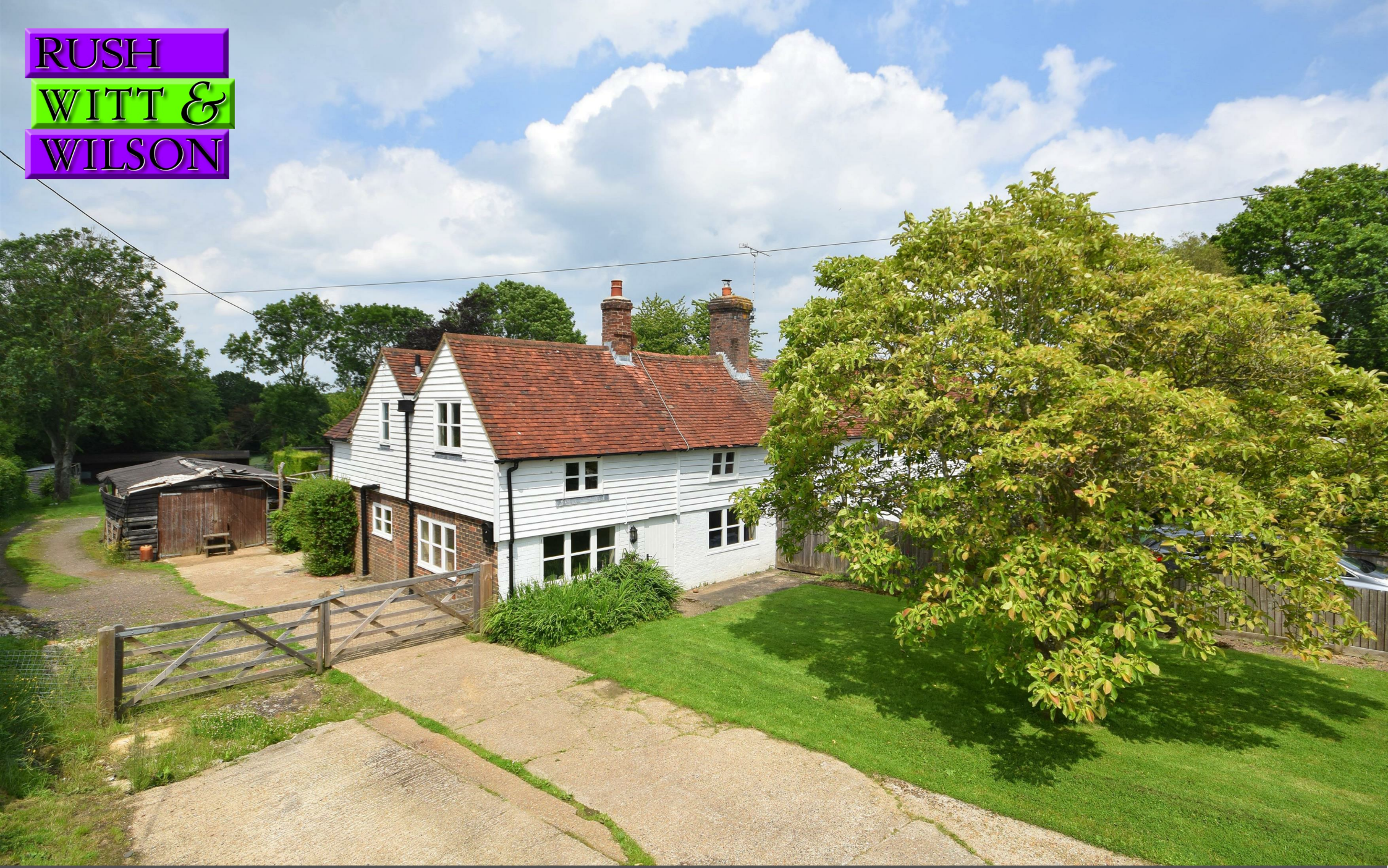
Chasmeed, Mill Corner, Northiam, East Sussex, TN31 6HT. £595,000 OIEO Freehold